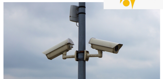
Read more about the benefits of the LPR Security Camera initiative on page 3