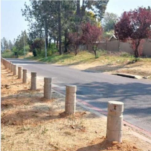
Greig Street Sidewalk Bollards installed: 2025

You may have noticed a recent upgrade on the sidewalk along Greig Street — the installation of sturdy new bollards. This small but significant change is already paying dividends for our community, and it's a perfect example of what we can achieve when we work together.