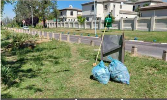
Greig Street: Cleaner and Greener

On Saturday, 4 October, members of the Vorna Valley Residents Association (VVRA) once again demonstrated the power of community spirit and teamwork. Thanks to the generous contributions of paid-up VVRA members and the ongoing commitment of residents, a major cleanup and beautification initiative took place along Greig Street in Vorna Valley.